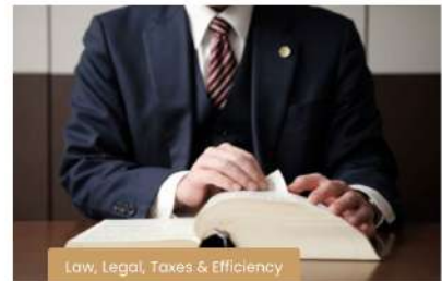
Law, Legal, Taxes & Efficiency