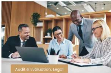
Audit & Evaluation, Legal