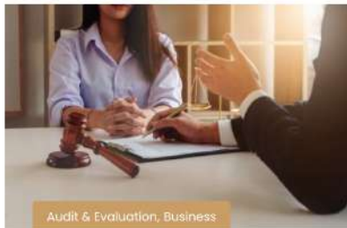
Audit & Evaluation, Business

Decision Are A Professional Attorney & Lawyers Services Provider Institutions. Suitable For Law Firm, Injury Law, Traffic Ticket Attorney, Legacy And More.